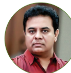
Mr. K. T. Rama Rao Minister of Municipal Administration & Urban Development (Telangana State) Vignan Group*