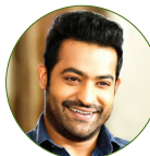
Mr. N. T. Rama Rao Indian Actor Vignan Group*