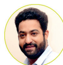
JR. N.T. RAMA RAO Indian Actor Vignan Group*