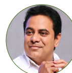
K.T. Rama Rao Former Minister of Municipal Administration & Urban Development (Telangana) Vignan Group*