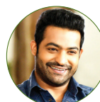
Jr. N.T. Rama Rao Indian Actor Vignan Group*