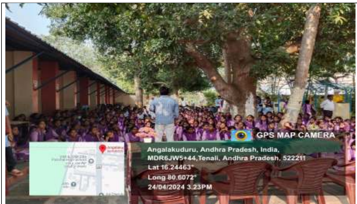
Awareness on Summer in ZPHS Angalakuduru on 24.04.2024

So people must take their time and remember to take breaks. It's also a good idea to reschedule their work hours to cooler times of the day and avoid midday heat. Every step of the program was appreciated by the representatives of the administration. This event created a great stir among the students.