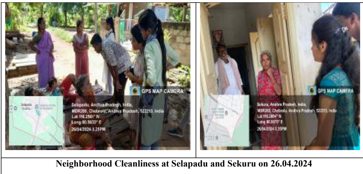
Neighborhood Cleanliness at Selapadu and Sekuru on 26.04.2024

The UEAC team organized an event at our adopted village Selapadu, Sekuru on 26 April 2024. The 45 students including section coordinators, chief organizers, coordinators and volunteers participated in this event. Living in a clean environment makes life healthier, less stressful, and more pleasant. It can improve the self-image of residents and the neighbourhood as a whole. A neighbourhood that smells like garbage or looks like a dump is an undesirable place to live and work. Thus, the participants were highly enthusiastic to make it a big success and addressed several key points. Walk, bike, or use public transportation to reduce air pollution. Teach others about the importance of keeping our environment clean. Participate in community clean-up events to help maintain cleanliness. Respect animals and their habitats to maintain a balanced ecosystem.