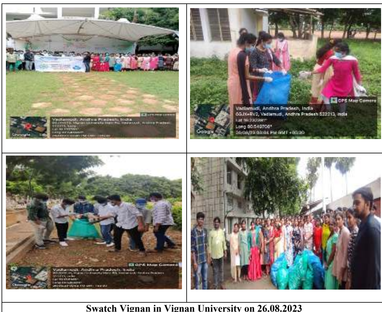
Swatch Vignan in Vignan University on 26.08.2023

The Program commences an assembly of NSS (Volunteers and coordinators) and at 1:45 PM the dividing of groups takes place according to their disciplines and each branch has contributed their efforts to make the University clean. By the time of 3:30 PM, all were gathered at the H- -Block Oat for the small interaction with the NSS core team and an appreciation for the accomplishment of the event further proceeded by clicking a few photos and finally, everyone had dispersed to their respective classes with a thank you note.