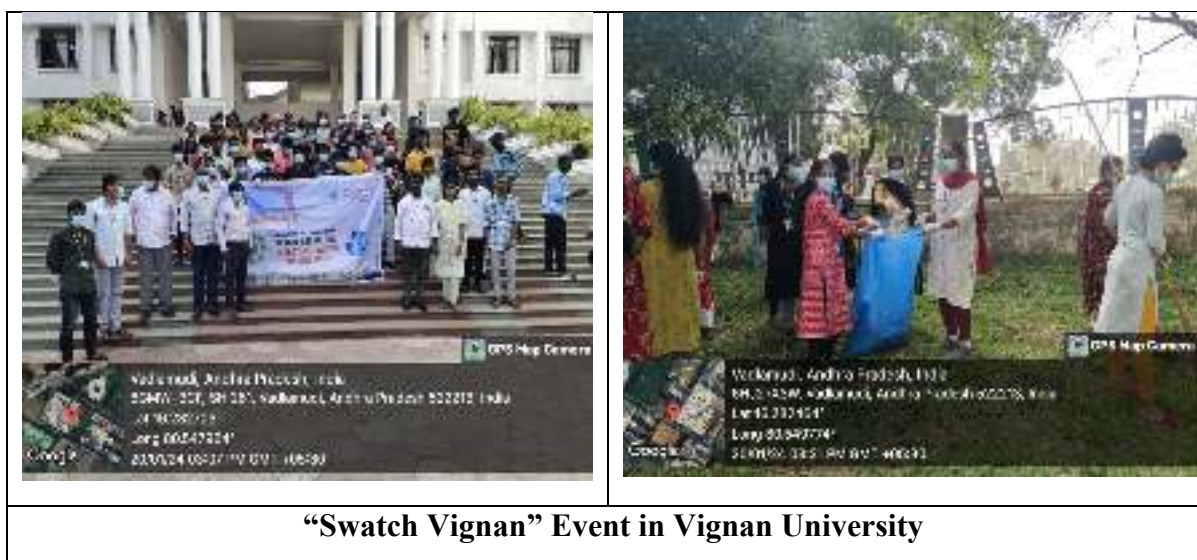
“Swatch Vignan” Event in Vignan University