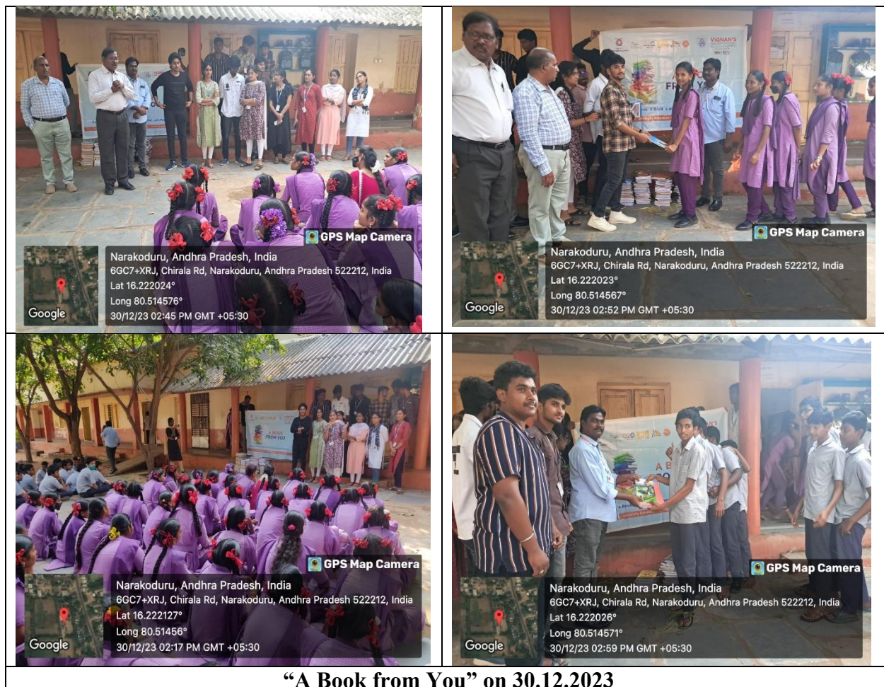
“A Book from You” on 30.12.2023