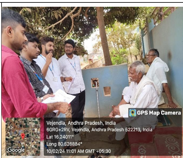
Awareness on Food Adulteration at Vejandla on 10.02.2024