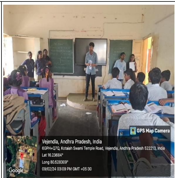
Awareness on Say no to plastic at Vejandla high school on 09.02.2024