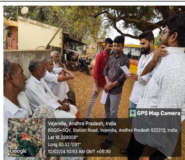
Awareness on Food Wastage at Vejandla on 10.02.2024