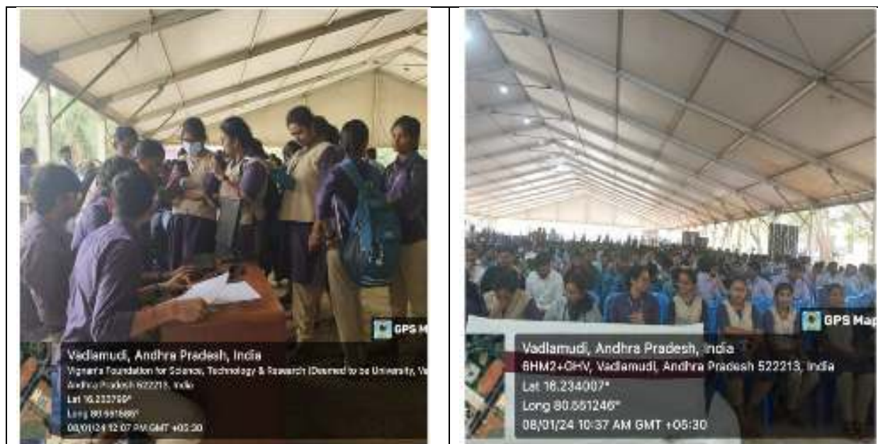
Enrolment of vote at Vignan University on 08.01.2024