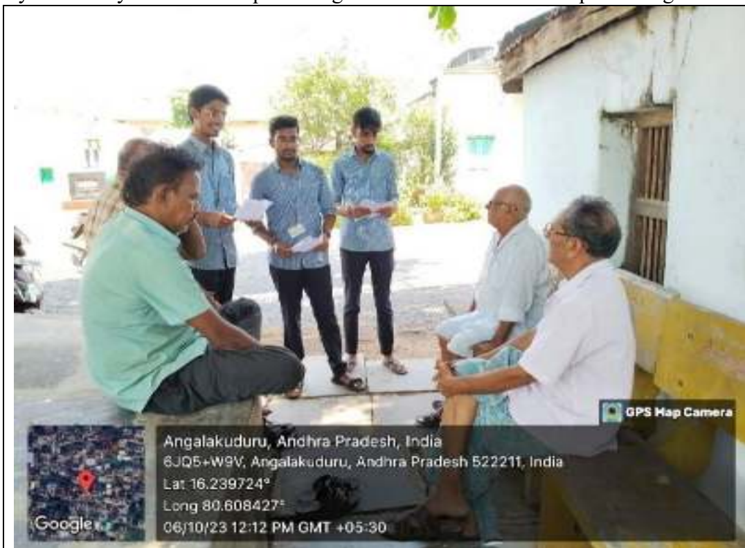
Awareness on Cyber security Crimes at Angalakuduru on 06.10.2023

The UEAC team, including section and main organizers, coordinators, and 35 volunteers, assembled at the college, marking the start of the event at 11:30 AM. The session concluded at 2:00 PM, successfully disseminating knowledge on cyber security risks and preventive strategies. Through this initiative, the team reinforced the importance of cybersecurity awareness in protecting sensitive information and preventing data breaches.