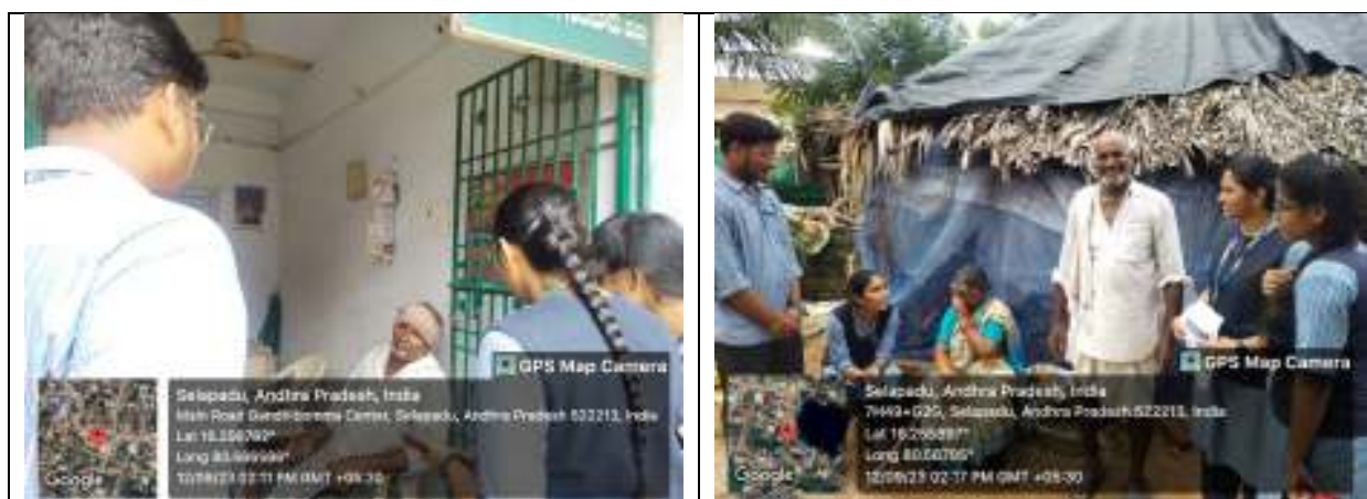
Awareness on Cyber Crimes at Selapadu on 12.09.2023

Thereby after a small interaction with the NSS core team and an appreciation for the accomplishment of the event further proceeded by taking a few photographs Finally Everyone was dispersed to their respective classes with a thank you note.