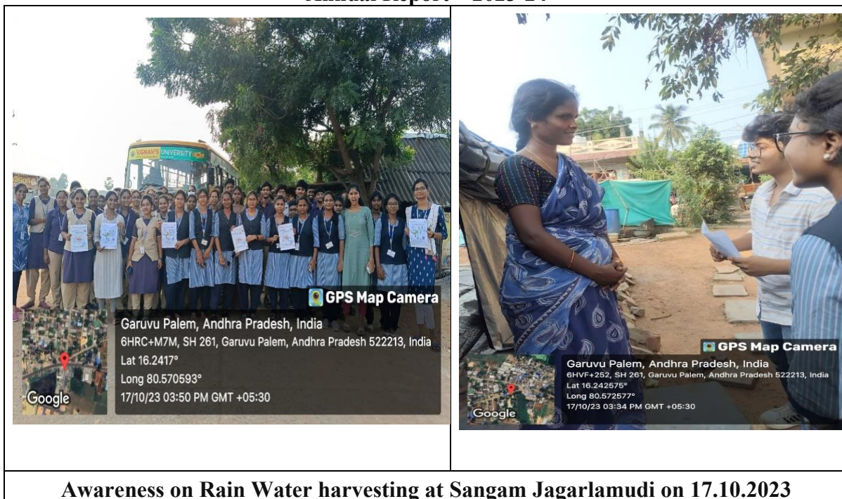
Awareness on Rain Water harvesting at Sangam Jagarlamudi on 17.10.2023