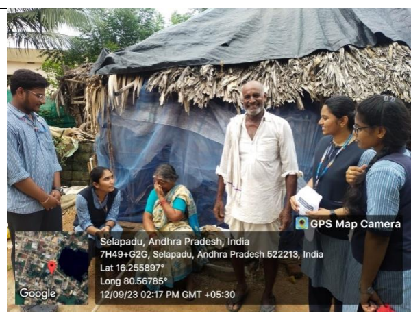
Awareness on Cyber Crimes at Selapadu on 12.09.2023