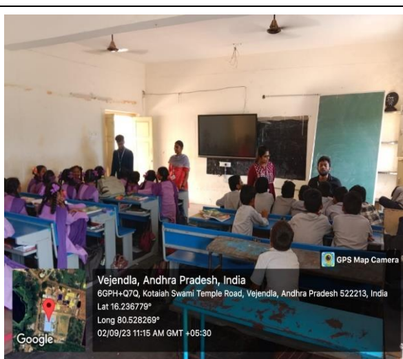
Awareness on Higher Education in Vejandla, ZPHS on 02.09.2023