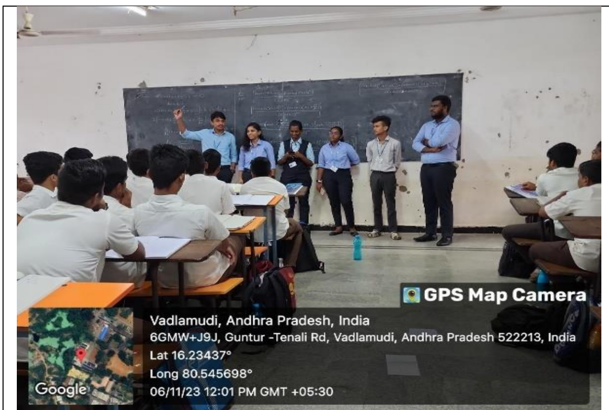
Conducting a Session On Teen Counseling on 06.11.2023

They will get to know how the individual should react to the situation and also stabilize themselves as per the situation and dos or don'ts of their current age by considering a few demographic conditions as per societal change.