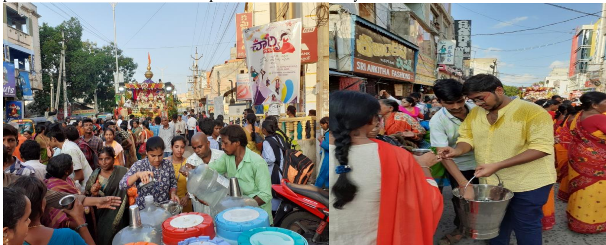
The UEAC volunteers involving in serving food and traffic control.

All the 65 volunteers participated actively and made the auspicious day more delightful. In this way, the event ended with a lot of energy, devotion, and willpower. Our University had provided the transportation facility for the volunteers.