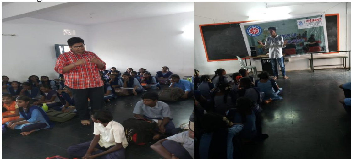
Awareness program on Higher Education at Vejendla by the UEAC Unit

Students in government schools nowadays are facing a problem of not having an idea on what to do after the completion of their high school studies. This was noticed by the students of the Department of Information Technology, Vignan's University and took an initiative and organized an awareness campaign on higher education for the students in Vejendla ZPH School. A total of 50 students who are pursuing their B.Tech degree in the branch of Information Technology and Electrical & Electronics Engineering were participated in this campaign and addressed the total of 130 SSC students. Initially, an inquiry session was started to know the amount of knowledge they know before the conduction of the camp at 11:30 AM. After completion of inquiry session, shared information on different types of courses, eligibility criteria and the steps to follow to reach after X class to the 10th Class Students. Student volunteers gave a detailed explanation of further studies i.e., on under graduation and post-graduation courses and availability of scholarships. After that, a small introduction about the importance of sports was also explained and the event was ended up at 1:00 PM. All the students were actively participated in the session and made it a grand success.