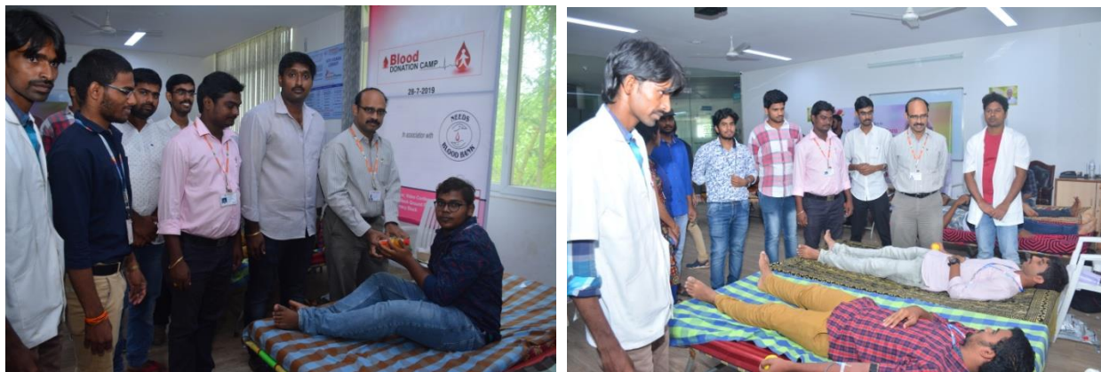
The Blood Donation Camp Organized by the UEAC Unit