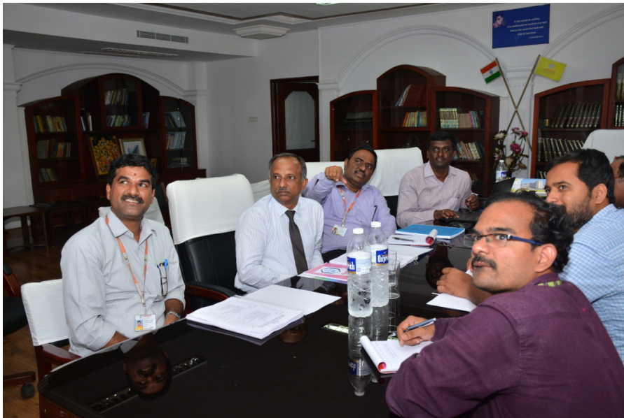
Faculty members of EEE dept. with the external members at BoS.