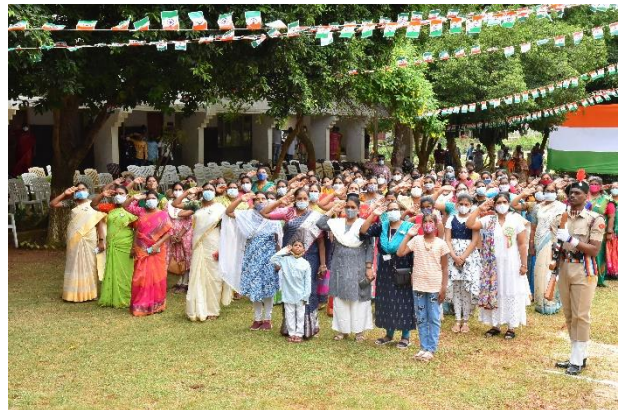
Staff and Students attending the celebrations