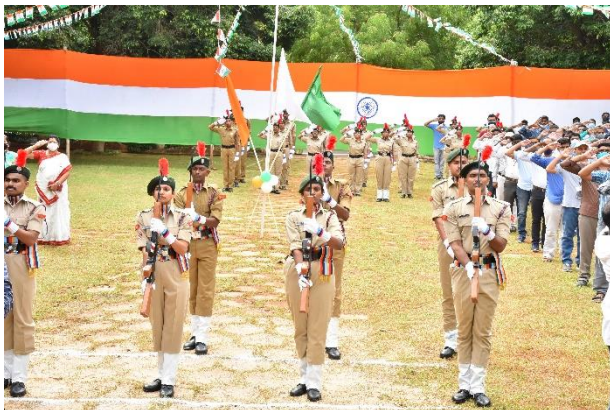
NCC Cadets giving the Guard of Honor