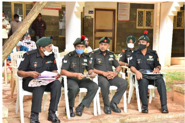
P.A Staff from 25 (A) & 10(A) Battalion