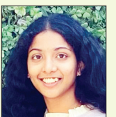
N. Phavitra III DS

Vignan Mahotsav's Fine Arts competitions served as a testament to the immense talent and artistic passion among students. The fest not only provided a creative outlet but also reinforced the importance of cultural and artistic expression in today's world. With each competition showcasing distinct skills and artistic perspectives, the event was a resounding success and a memorable experience for all involved.