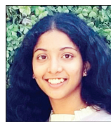
N. Phavitra III DS

Through these competitions, the festival not only celebrated the strength and skill of female athletes but also set the stage for the next generation of champions. The event left an enduring impact, inspiring more women to step forward, embrace sports, and carve their own paths to success in the athletic world.