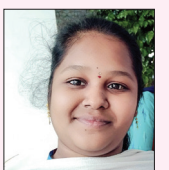
N. S. N. B. Nihari II CSE

Technical design saw the preparation of several banners, including those for the main event, venues, and competitions. Banners, directional boards, venue markings, and printed scoresheets were arranged for stage and quality. Accommodation was arranged in A block and girls' hostels, with additional facilities. Transport was organized with buses and driver contact details provided. Dance competitions were coordinated by assigning volunteers and explaining the rules. Photography and video editing teams were organized to cover rehearsals and document behind-the-scenes activities.