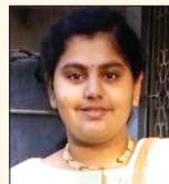
M. Charitha III DS

Western Vocals: The Western Vocals competition is undoubtedly one of the most anticipated events at Mahotsav, drawing attention from both participants and audiences alike. With two stages-the Prelims and the Finals-this competition brings out the best in vocalists who are ready to showcase their mastery over the English musical genre.